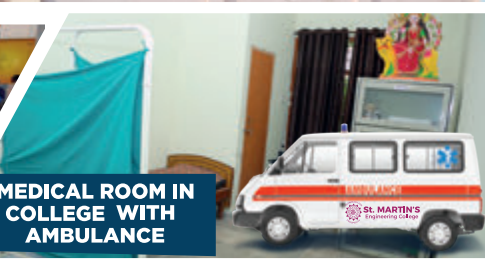
MEDICAL ROOM IN COLLEGE WITH AMBULANCE