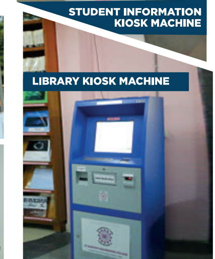
LIBRARY KIOSK MACHINE