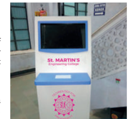
STUDENT INFORMATION KIOSK MACHINE