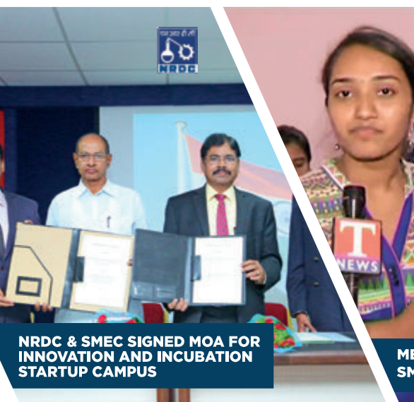
NRDC & SMEC SIGNED MOA FOR INNOVATION AND INCUBATION STARTUP CAMPUS