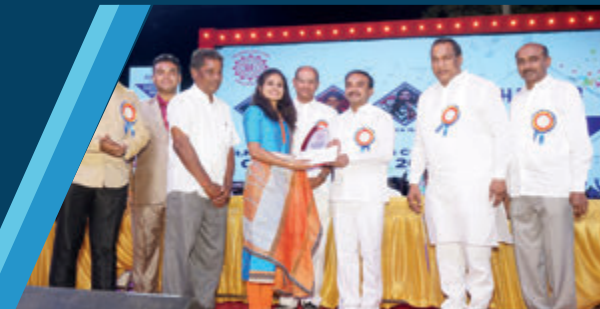
Hon'ble Finance Minister Sri Etela Rajender appreciates the achievements of St.Martin's Engineering College Students and congratulates gold medal winner.