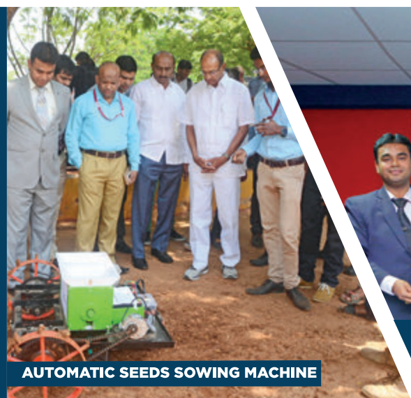
AUTOMATIC SEEDS SOWING MACHINE

MECHANICAL - Machinery designing, Metallic 3D printer, Four Wheel mechanism, Electric car. Metallic 3D printer was selected as the only project from the 2 Telugu speaking states, for "Switch 2016" (Global level innovation and Technology summit) and got 2nd prize for Make in India Concept at Vadodara (Gujarat). "Four Wheel steering Mechanism" has bagged 1st place at National level project expo conducted during march 2017 at Hyderabad. As part of our endeavour to focus on Research & Development Texas Instruments has established an Innovation center in the Department of ECE and IOT maker's space & SAP in the school of Computer Science.