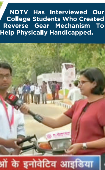
NDTV Has Interviewed Our College Students Who Created Reverse Gear Mechanism To Help Physically Handicapped.

R&D cell of SMEC coordinates various research activities of department. To enhance the research activities in the college, Technovation-2K18 was organized in the month of March 2018. Over 100 projects came from all over the Nation. The core research areas of various departments are Civil : Structural model exhibition which demonstrates real time applications ECE - VLSI , Embedded System Signal Processing, NanoTech, The Renewable Energy sources. IT/CSE - Design of algorithm, Data base management system, object oriented programming, big data EEE - Power systems, Renewable Energy etc.,