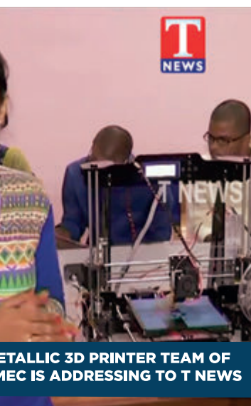
METALLIC 3D PRINTER TEAM OF SMEC IS ADDRESSING TO T NEWS