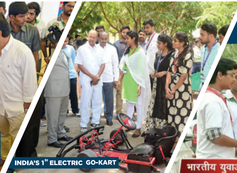
INDIA'S 1 st ELECTRIC GO-KART